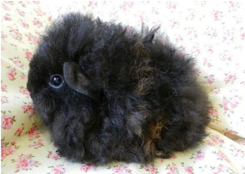
Plate 2.11 Alpaca Guinea pig

They originated from English Peruvian Guinea pigs in England. The alternative breed names include Boucle, English Peruvian and Curly Coronet. This breed also has an excellent record for the longest lifespan in Guinea pigs, with about 5 to 8 years at best. The Alpaca Guinea pigs are probably the ideal choices for Guinea pig seekers. Alpaca Guinea pig portraits all the qualities with all the traits that Guinea pigs' seekers want such as furry, fuzzy, playful, cute, hairy, even though not all these adjectives are fitting for all breeds. They have wonderful thick and wavy hair and come in many different colours ( Benton, 2016 ).