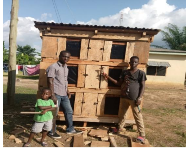
Plate 3.3: Three (3) tier housing unit