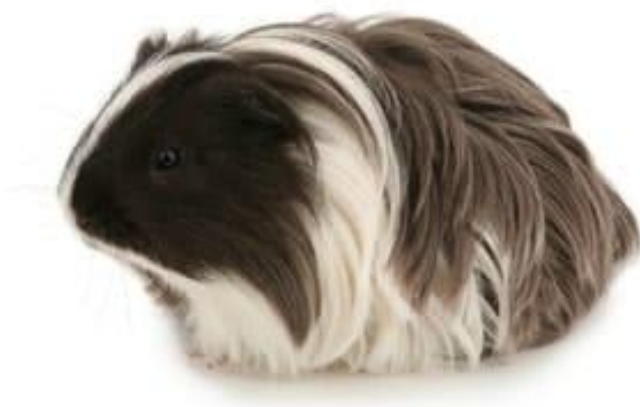
Plate 2.7: Silkie Guinea pig

The Silkie breeds are very satisfying to people than hunger for aesthetic value. There is another common name for the silkie breed of Guinea pigs: sheltie. They have an average lifespan of 5 - 7 years; their lifespan depends on administering proper health care of the animals. The silkies stay shy for a longer duration than the other breeds. With their gentle personality, they make great pets for kids to play with. But they need regular grooming, extensive care and love from an adult who understands their needs. With silky smooth hair, they look like the rulers of the Guinea pig kingdom. Their long hair does look great, especially because of the shiny, lustrous and elegant colors. With a teardrop shaped body, their hairline is spectacular in itself. It has a perfect wave of hair falling behind the face, with no hair growing in opposite directions anywhere in the body (Monique, 2021).