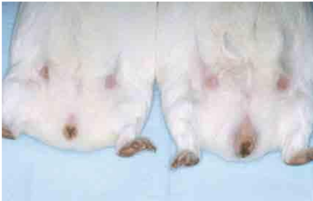
Plate 3.8: Sex determination of female

seen for the sows (females) (Plate 3.8) whereas males' sexes were detected by observing 'i' at their external genitalia area with prominent penis and testis (Plate 3.9). Sex determination/differentiation is quite laborious and time consuming but it is also good in order to segregate the males from females to avoid poor breeding performance among the animals.