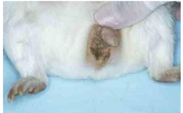
Plate 3.9: Sex determination of female