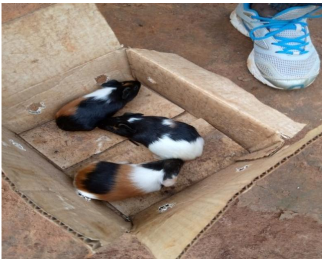
Plate 3.2: Qualitative traits of guinea pigs

Visual appraisals were assessed for all the 310 Guinea pigs used for the study such as hair texture, coat colour, profile (head, back and rump), body colour combinations and sex (Plate 3.2).