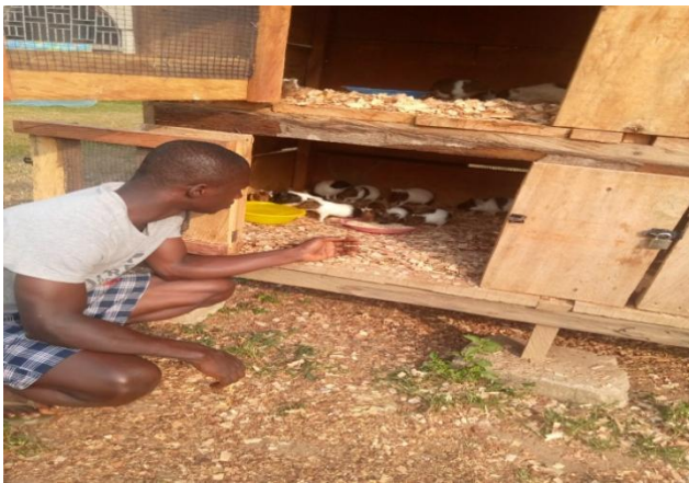
Plate 3.6: Assessing the health status of cavies

Guinea pigs used for this experiment were quarantined for five (5) days to check for visible signs of any ailments (Plate 3.6). Cleaning feed and water troughs were done daily. Wood shavings were changed every week to avoid making the animals feel uncomfortable. Routine deworming was also carried out by using 0.1 ml injection of Ivermectin every month to control both endo and ecto-parasites. 50 ml of Dettol was used to disinfect the Cavies pen every week to discourage the growth of microorganisms. 50 to 150 mg of vitamin C (Ascorbic Acid) was diluted in 1000 ml of water to boost Cavies immune system (Mancinelli, 2016; Handlos, 2018). Animals were vaccinated routinely to boost their immune system (Plate 3.7).