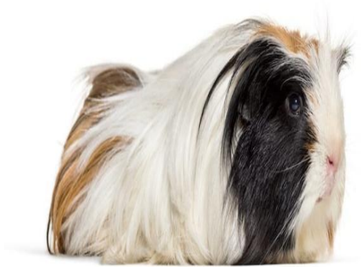
Plate 2.9: Coronet Guinea pig

is where the rosette is white, the majority of the coat is brown with black strands in between ( Benton , 2016 ; Monique, 2021).