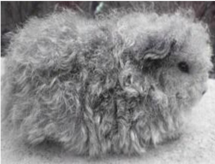
Plate 2.12 Merino Guinea pig

The Merino Guinea pig is also known as English Merino and Merino Peruvian with a proven life span of a minimum of 5 years with proper care. The maximum lifespan depends on a number of factors. The Merino Guinea pig is known for its friendly temperament. They have a varied body length as short as 4 inches and as long as 12 inches. Usually its appearance is similar to Texel Guinea pig, with curly coats short hair on the head are the differences. They are visually appealing than the rest of the breeds of Guinea pigs ( Benton , 2016 ; Monique , 2021).