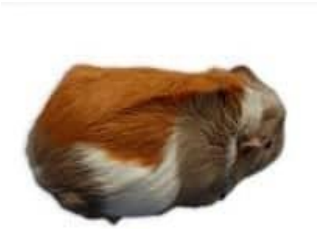
Plate 2.6: Ridges Guinea pig

Ridges Guinea pigs are originated from America. Their lifespan is in the range of 4 to 7 years. This breed is the best choice for aesthetics purposes. They have a very common ridge of hairline running down their back. Their hair grows in the reverse direction near their feet. Some adult ridge Guinea pigs are as small as 5 inches whereas others grow as long as 12 inches ( Benton , 2016 and Monique, 2021).