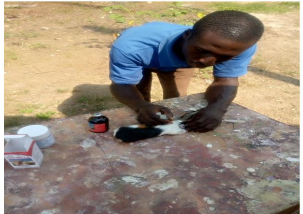
Plate 3.7: Vaccination of cavies