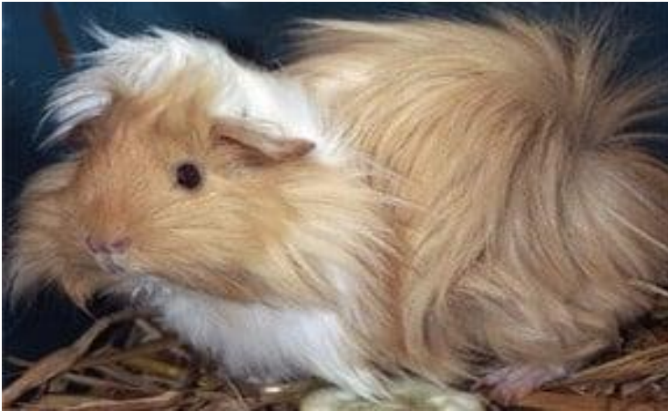
Plate 2.17: Sheba Guinea pig