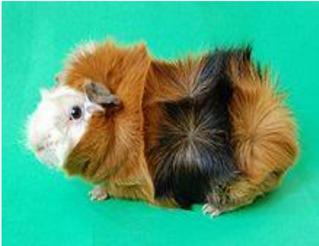
Plate 2.16: Abyssinian Guinea pig

emotionally connecting and adorable of all Guinea pigs. Their body length is between 8 to 12 inches that grows up to 4 cm. The hair coat can grow up to 4 cm in length. Abyssinians guinea pigs are noticed for their multiple colour variations ( Benton, 2016 ).