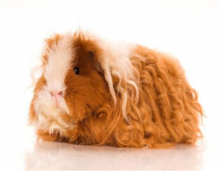
Plate 2.8: Texel Guinea pig

It is originated from England and also known as the prettiest breeds among Guinea pigs that came from England. They have multiple combinations of colours with aesthetic nature. They are known as affection breeds among Guinea pigs. Their lifespan is between 5 to 7 years. The Texel breed has an alternative name as Curlies. They have attractive curly hair. Their hair is straight towards their top, but gets gradually towards exclusive curliness towards the bottom and difficult to manage ( Benton , 2016 ; Monique, 2021).