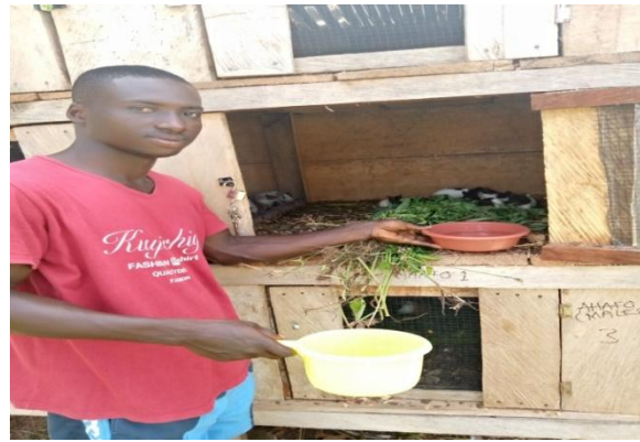
Plate 3.5: Water provision