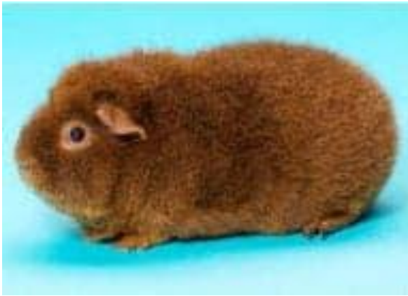
Plate 2.15: Rex Guinea pig

This type of the Latin American breeds is friendly. They grow as long as 17 inches in length with an appreciable lifespan of 5 to 6 years. Their hair length grow not more than 1 cm in length. Their unique traits such as wholly hair, dense coat and curly hair on their underbelly make them fuzzier in appearance and in texture.