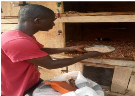
Plate 3.4: Concentrate supplementation

Animals were fed with forages (basal feed) such as Guinea grass ( Panicum maximum ), etc. Kitchen scraps and supplementation of concentrate (15 % crude protein) were given as well (Plate 3.4). Water was offered ad libitum. Feeding and watering troughs were washed every two days. Drinking water was changed every twenty four (24) hours to make sure the Guinea pigs had clean cool water to drink (Plate 3.5).