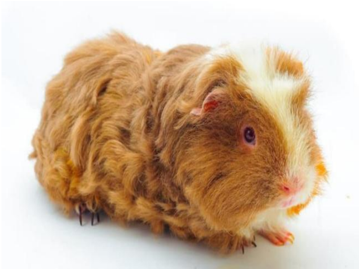
Plate 2.13: Lunkarya Guinea pig