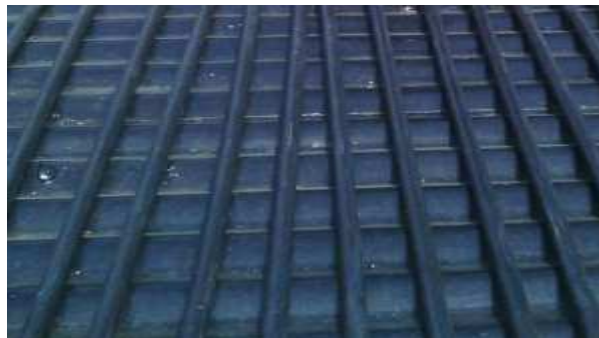
Figure 3 Attached fluid pipe onto the absorber plate

Pipe system (including risers and headers): Plastic pipes such as P.V.C were used for the piping system because of its rigidity and it's resistant to corrosion; this is very important because it can hold the water and keep it clean to be used domestically. Fig. 3 shows the attachment of pipe tubes to the absorber plate.