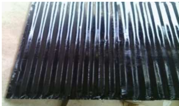
Figure 2 The constructed Absorber plate

The absorber plate- The absorber is made of aluminum because it is relatively cheap, has adequate mechanical properties, has good means of attachment to the fluid flowing pipes and other materials, and has good thermal conductivity and good resistance to corrosion. It is also painted black as shown in Fig 2 since black materials absorb heat very well and are able to retain the heat for a very long time.