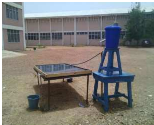
Figure 4 The prototype of solar water heater for the HCIM Department of Bolgatanga Polytechnic

In constructing and assembling the solar water heater, the system was divided into the following components: cold water storage tank, absorber plate, collector plate, insulation materials, fluid passage pipes and hot water outlet tap as shown in Fig 4. In order to produce the needed hot water, using solar energy, the collector was mounted on the ground in an inclined position across the path of the sun and was made to face south in order to receive maximum energy from the sun. The working fluid is water which is made to flow through the fluid tubes by natural convection which is also known as passive system. The collector used for the construction is glass-topped with a flat metal sheet which is painted black as an absorber and the whole assembly is attached to the tubes as shown in Fig 4. As the sun hits the collector surface the heat energy is transferred into the tube by means of the absorber plate and as the water heats up the lighter portion rises and the colder and the heavier one moves in to take their place by natural convection.