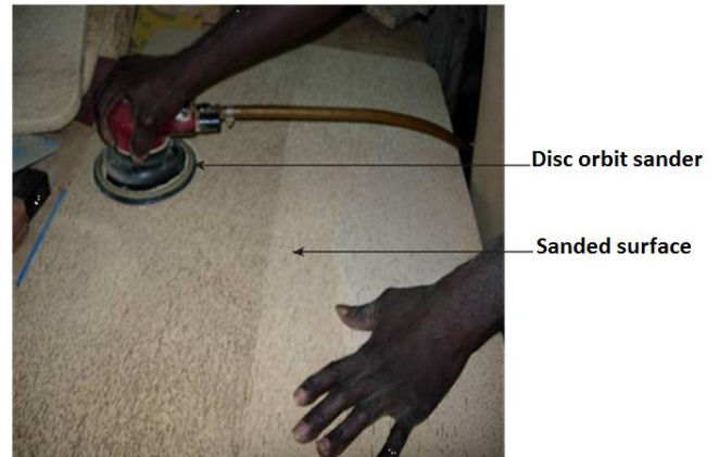
Fig. 4 Disc orbit sander for sanding oil palm lumber

Abrasives used for sanding were 60 and 80 grit for initial sanding and 120 grit for light sanding. Finally, the disc orbital sander (figure 4) with abrasive grit of 180 was used for smooth sanding and also for removal of the raised edges after using the drum sander.