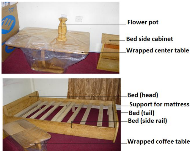
Fig. 7 Products manufactured from oil palm lumber

Therefore, in an attempt to produce a bed from oil palm lumber, care was taken to ensure that the support for the foam mattress rest on the floor instead of the side rail. Any force exerted on the support for the foam mattress is transmitted to the floor instead of the side rail. It is expected that in the design of wood products using oil palm lumber, manufacturers will take into consideration the maximum force acting on the members in order to prevent failure of the members due to excessive load.