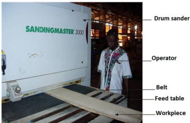
Fig. 3 The drum sander (model 3000) used

A drum sander (model 3000) (figure 3) was used to perform the sanding operation. It has an adjustable table to pick any thickness of wood samples and sand to predetermined thickness.