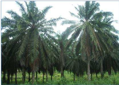
Fig. 1 Oil palm tree plantation at Norpalm Limited

Trunks of oil palm trees were extracted at Norpalm Limited at Aboadze near Takoradi in the wet semi-deciduous forest zone of Ghana using a chain saw machine. The average age of the palm trees shown in figure 1 was 40 years.