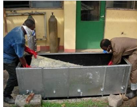
Fig. 2 Oil palm lumber being treated with preservative

Oil palm trunks of moisture content ranging from 100% to 120% were sawn in the forest into beams of thickness 50mm and lengths 1.8m and 2.4m using a chainsaw machine. The beams were immediately transported to the workshop of the Department of Construction and Wood Technology Education of the University of Education, Winneba for further processing. In order to protect the beams from insects attack, they were immersed into a preservative for three (3) days. The preservative was made up of 2 litres of Dursban 4E and 504 litres of water. Beams being treated with preservative are shown in figure 2. The preservative-treated boards were kiln dried to moisture content between 8% and 10%.